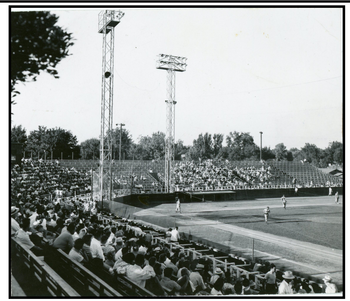
Super Sleuths Needed!

With the major league baseball season coming to an end next month, we thought it would be fun to see if anyone can recognize this stadium or team!