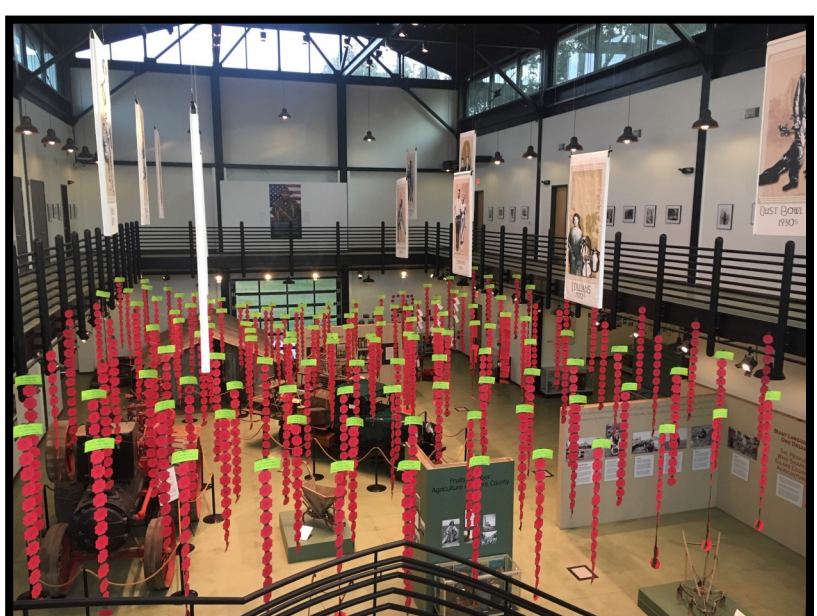
Previous year's display of poppies at the Museum

The commemorative event that will take place on November 19, 2022 at 10:00 a.m. at the Museum will serve as the unveiling of the poppy display. The event will include the Central Valley Vietnam Veterans Color Guard, local veterans sharing history, poetry recited by students, and patriotic music played by the Mt. Whitney High School band. The event will be free and open to the public and we encourage all students and teachers who participated to attend the event to see the impact that they have had on our community through learning about history. Please join us in sharing how important it is to recognize our veterans for fighting for the freedom that we have as Americans!